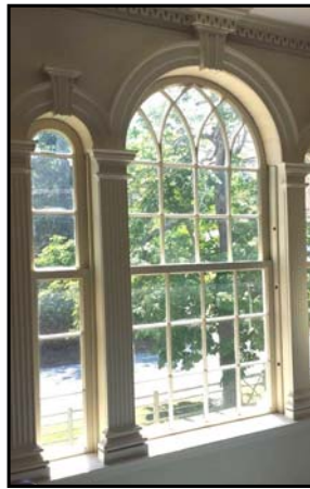
View from the upstairs Palladian window